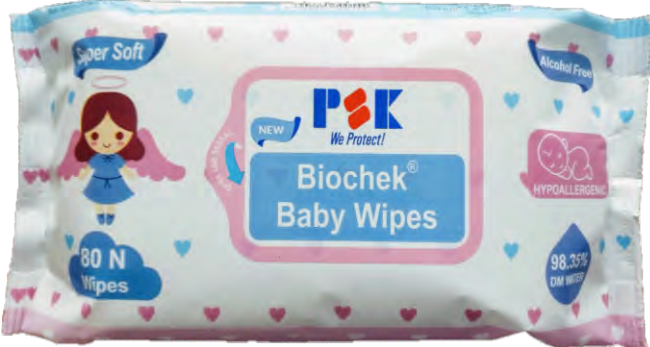
Each pack contains 80 Baby Wipes of size 150 mm x 200 mm

Ingredients: 98.35% Deionized Water, Sodium Benzoate, Glycerine, Disodium EDTA, Vitamin E Extract, Aloe Vera Extract, Essential Oil / Extract for Fragrance, Phenoxyethanol & PEG 40 Hydrogenated Castor Oil Biochek ® Baby Wipes do not contain any Parabens, and are made using the maximum quantity of pure DM Water. This helps us keep the wipes as free of chemicals as possible for your child's protection. In case you feel that the top wipes feel a little dry, just turn the packet over and squeeze the packet gently to re-distribute the liquid content into all the wipes.